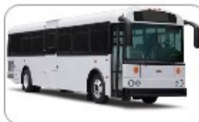
Limo / Motor Coach