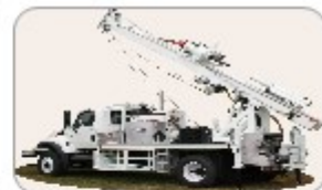
Drilling / Oil Field